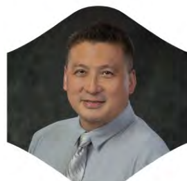
Mayor Simon Yu (City of Prince George)