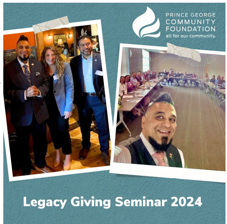
Legacy Giving Seminar 2024