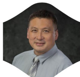
Mayor Simon Yu (City of Prince George)